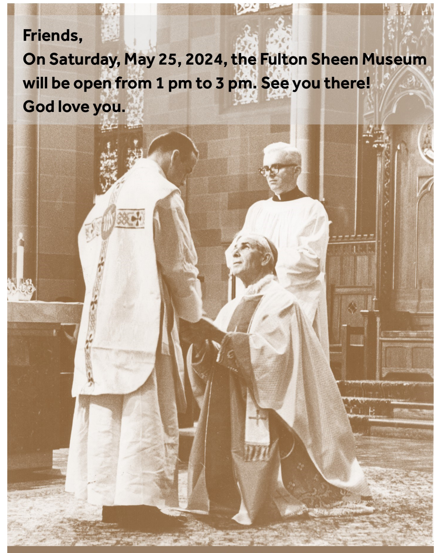
419 NE Madison Ave., Peoria IL 61603 * CelebrateSheen.com